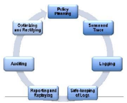
Fig 1: Cloud Accountability [1]

Safe-keeping of Logs: After logging is done, we need to protect the integrity of the logs to prevent unauthorized access and ensure that they are tamperfree. Encryption may be applied to protect the logs. There should also be mechanisms to ensure proper backing up of logs and prevent loss or corruption of logs. Pseudonymisation of sensitive data within the